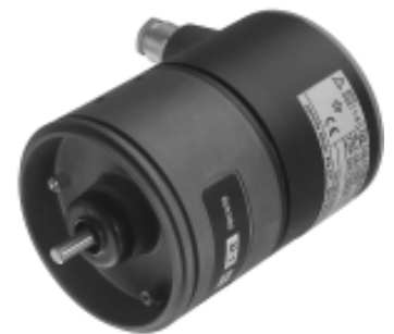
KINAX WT 710 with additional gear