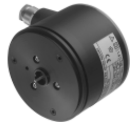
KINAX WT 710

= -40 \text{ °C} \dots +75 \text{ °C T5}